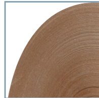
Largest tape capacity in the industry Eliminates the need for frequent roll changes.