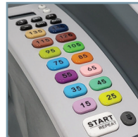
Automatic Function Allows the operator to specify tape length and will automatically dispense them to dramatically increase productivity.