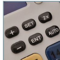
Programmable Keys Can be configured to dispense up to 6 different tape lengths in a sequence allowing maximum flexibility.