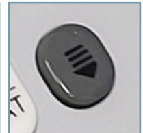
Random Key Length To allow tape to be dispensed in any length with increment of 1cm without limit.