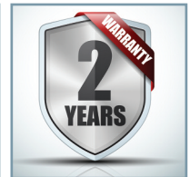
Extended warranty comes with 2-year parts warranty and 1 year labour cover