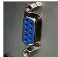
Built-in RS232 connector Allowing Hexadecimal tape length input from any devices for ultimate carton sealing solution