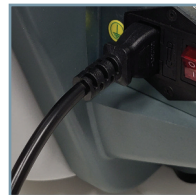
Extra long detachable cord For improved operator ease, comfort and safety.